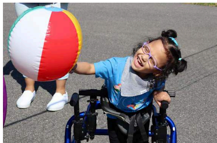
The Children's Center

Journey of Progress: Reflecting on Our Milestones