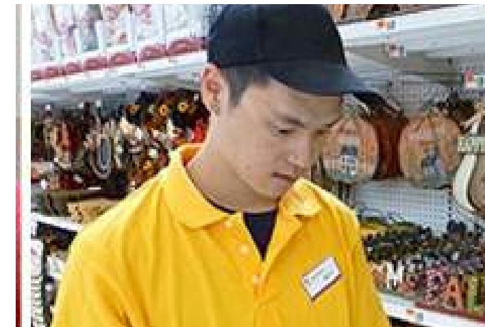
The Employment Program