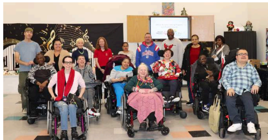
Adult Day Services